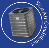
Size Air Conditioner